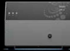
MP-V | Versatile