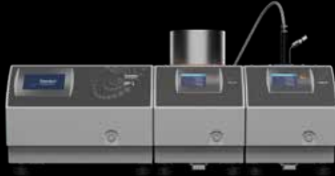
MP-1 | Advanced